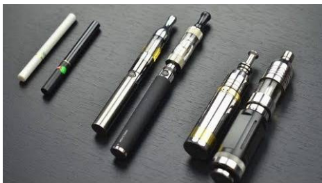
E-Liquid & C-Liquid Snapshot