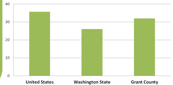
Percent of Adults that are Obese

Obesity increases the risk for high blood pressure, high cholesterol, type 2 diabetes, heart disease, and stroke. Having a primary provider will assure access to screening and help for living a healthy lifestyle.